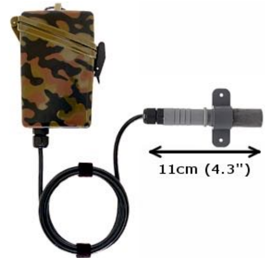
TrafX Trail Counter