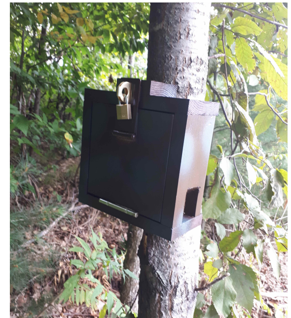
Our Customized Enclosure